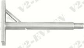
DH-9020-I DHS Angle Guide 135°