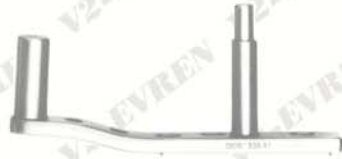
DH-9040-I DCS Angle Guide