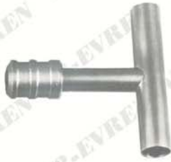
DH-9024-I DCS/DCS T-Handle with Quick Coupling