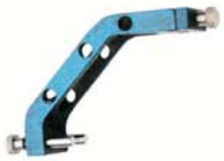
TB-8025 Proximal Outrigger